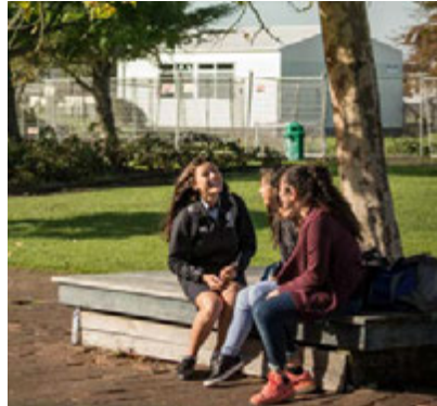
PPTA supports a fairer tax system for all students and their families.

In education state funding needs to be sufficient to support state schools