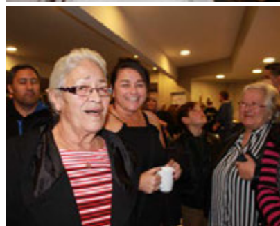
Movers and shakers at last year's hui.