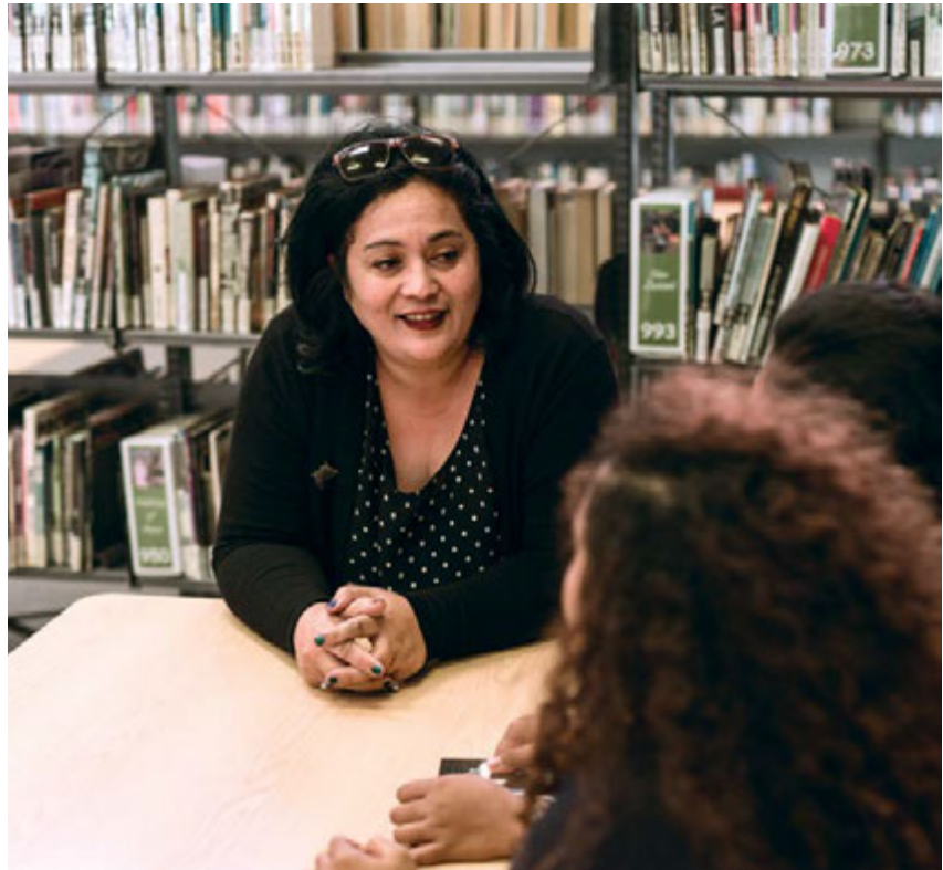
The majority of the public supports the vital work teachers do.

they recommended, it was decent. 67 percent wanted teachers to receive more than a 10 percent increase and 90% wanted more than 5%,” Lynda said.