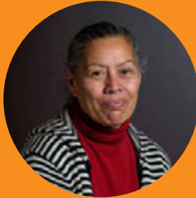
Wiki Te Tau

Alfriston College, back up for PPTA Te Huarahi Māori Motuhake