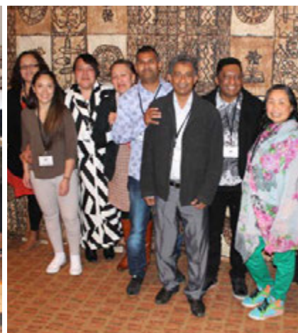
Pasifika teachers leading the way.