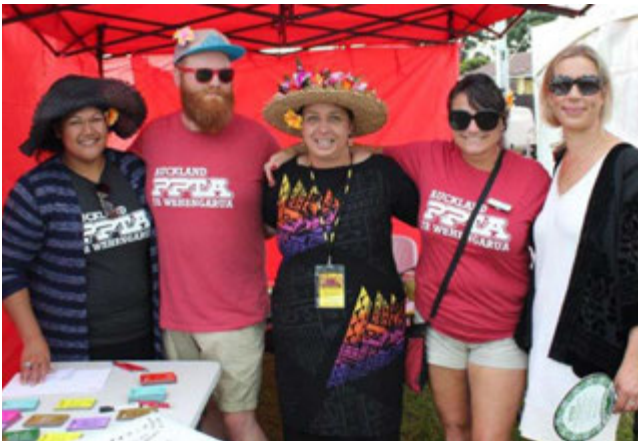
Auckland PPTA members celebrating Pasifika culture.