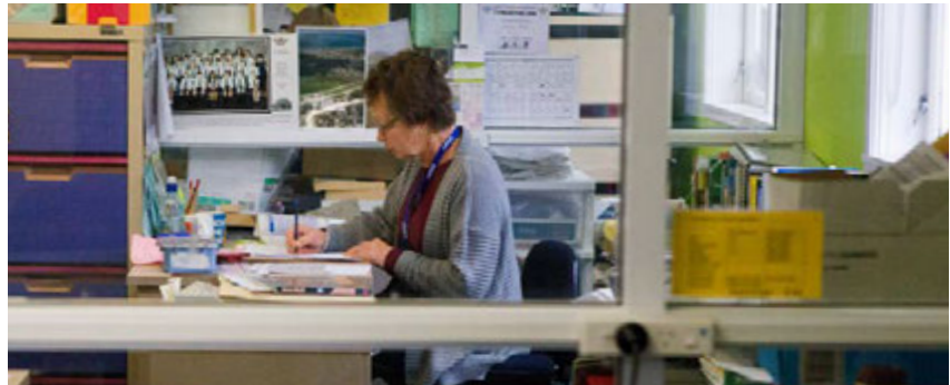
The workload of teachers has grown considerably since the introduction of NCEA.

In most schools I have worked, technology