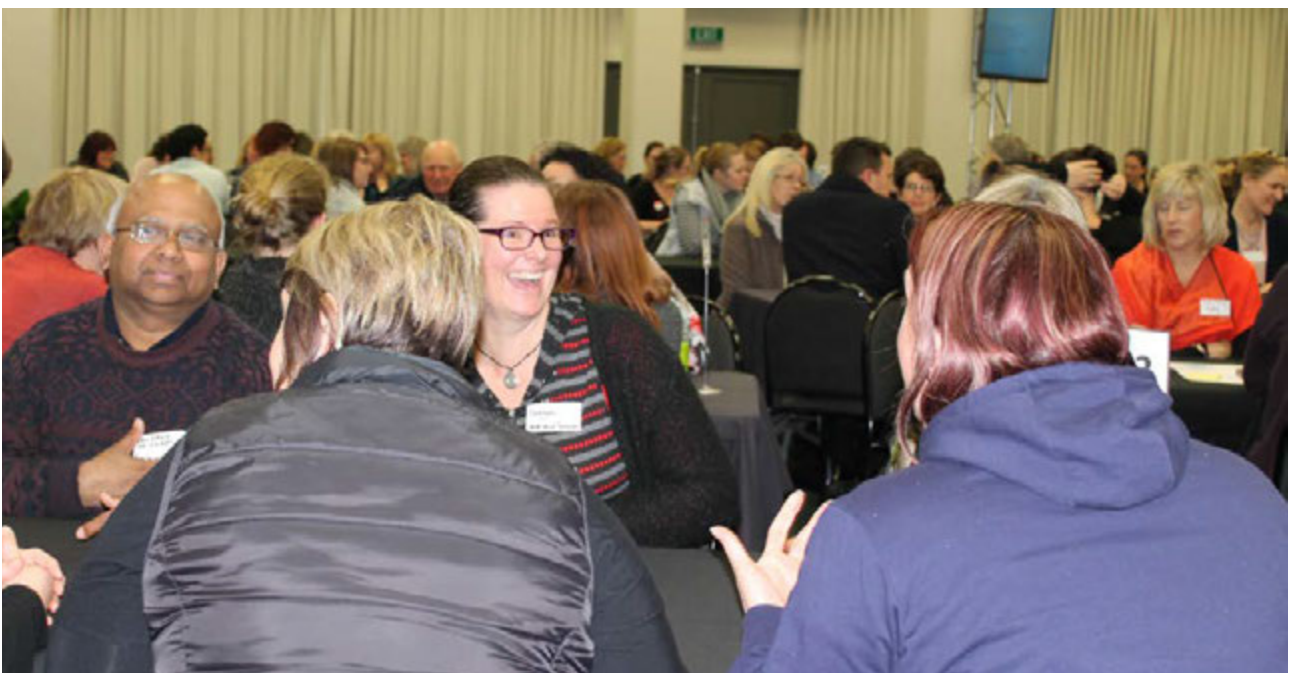
Talking community and collaboration at the set up of the Palmerston North East community of learning.