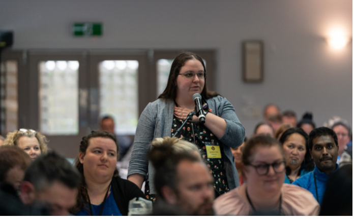
*All of these conference papers are available on our website under the Charter Schools Campaign Tab