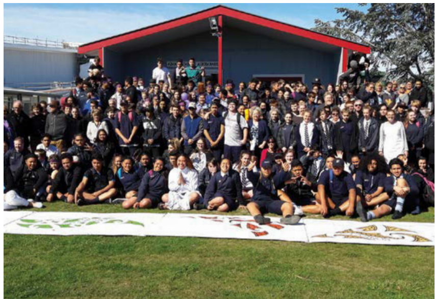
56 years of history – Aranui High School community will be able to say farewell

and staff went out of their way to ensure that local youth were catered for through the implementation of Sport, Drama, Technical and Early Childhood Academies. Many young people stayed longer at school because of these initiatives, and went on to have fine careers.