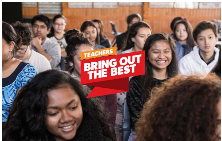
Teachers want to bring out the best in their students and the community is behind them.

The government will have to listen – because only then will we be able to recruit and retain the teachers our children deserve.