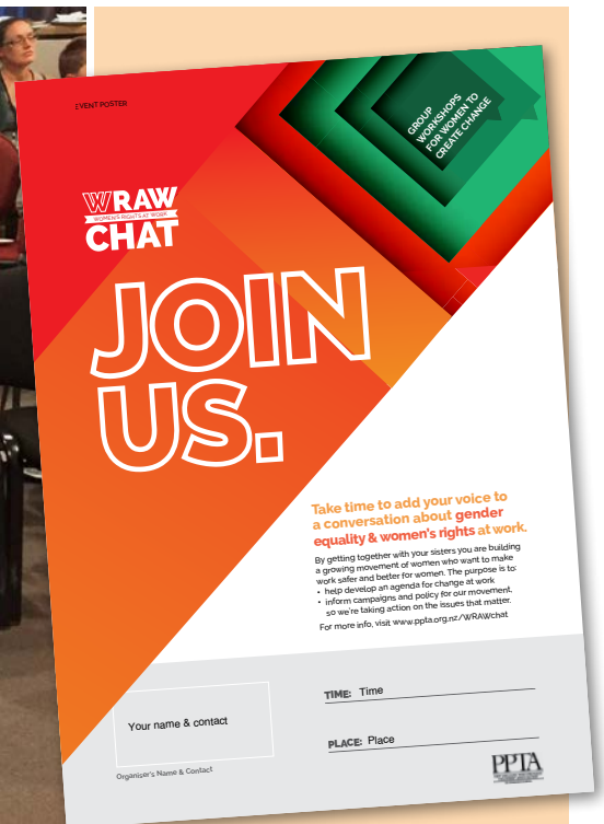
PPTA women talk the talk at the 2019 Issues and Organising conference.