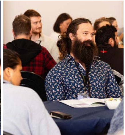
Talking activism, workload and social justice at the 2019 NETs conference

teachers are in this profession, why they are striking and why it might be seemingly unattractive to be a teacher at the moment.