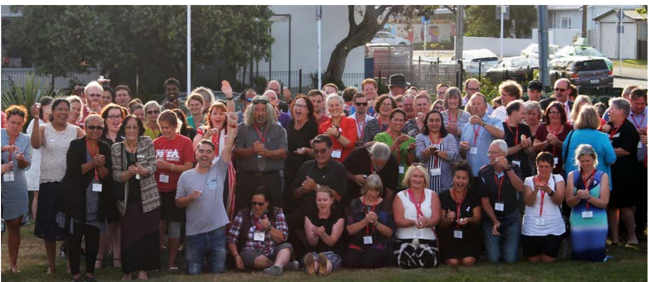
Members at PPTA’s 2017 Issues and Organising conference create a ‘pathway to safety’ to draw attention to the Domestic Violence Victims’ Protection Bill.

A network of community organisations working to end violence to women and children across New Zealand.