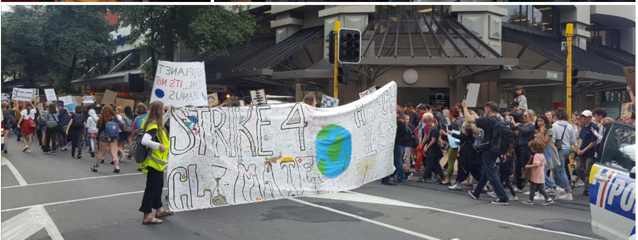
Thousands of students packed Wellington's Civic Square on March 15 during the School's Strike for Climate.